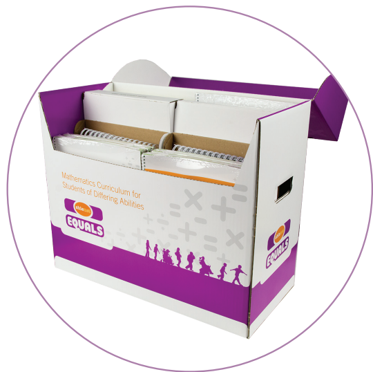
Equals Content Kit